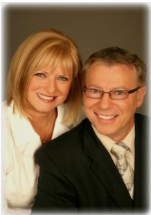
Sales Representative/ Broker